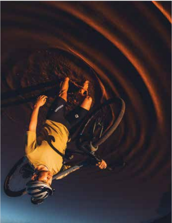
Ocean and Sand